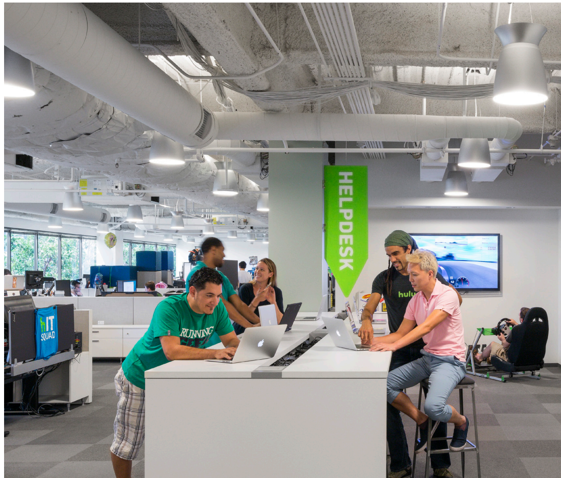
Hulu | Gensler